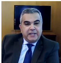
H.E. Motaz Zahran Egypt's Ambassador to the United States

Asked how the Egyptian-American diaspora can contribute to prosperity "back home" in the Middle East, El-Erian had this to say: "If you unleash the energy of our young people, they are transformational. Look at what's happening in terms of startups in parts of the Arab world . . . This is what it's about: education, infrastructure, and small-scale financing."