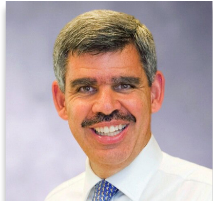
Dr. Mohamed El-Erian, Chief Economic Advisor at international financial services provider Allianz, as well as President of Queens’ College, Cambridge.

That’s the message of Dr. Mohamed A. El-Erian, President of Queens’ College, Cambridge, and advisor to international financial services provider Allianz, as well as investment manager Gramercy.