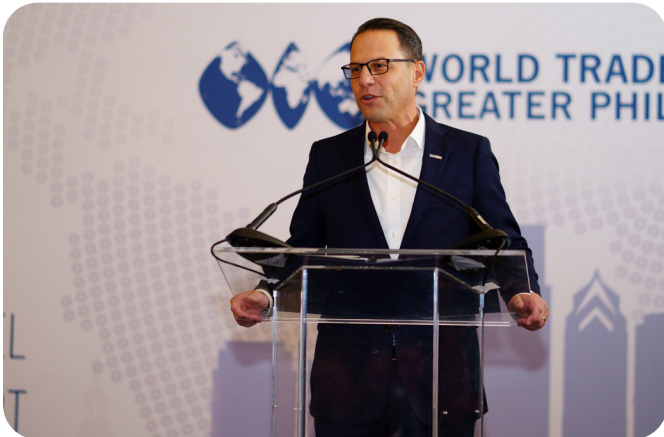
Governor Josh Shapiro, Recipient of Global Business Leadership Award