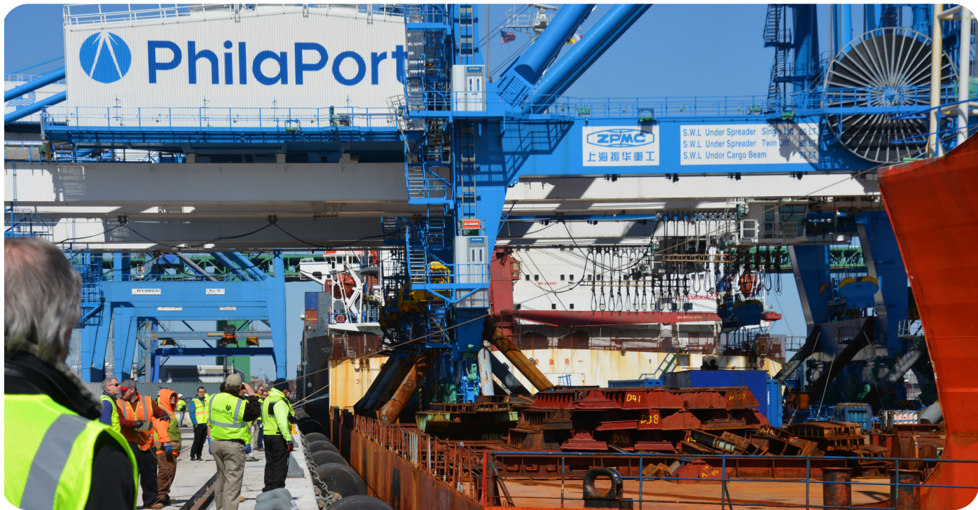
PhilaPort employees at work.