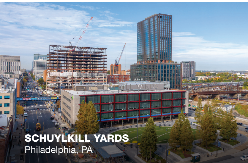
SCHUYLKILL YARDS Philadelphia, PA

Brandywine Realty Trust congratulates the World Trade Center of Greater Philadelphia on its outstanding efforts to improve our region.