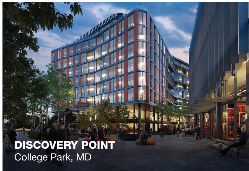
DISCOVERY POINT College Park, MD