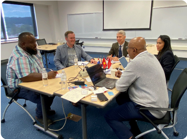
Local businesses meet with Authorized Trade Representatives at Bringing the World to Pennsylvania, held at Penn State Great Valley campus and Temple University Center City campus.