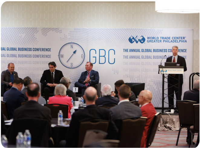
The Annual Global Business Conference held in partnership with Temple University