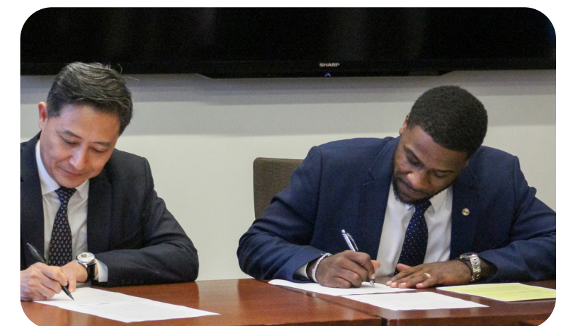
Signing of MOU between WTCGP and World Trade Center Tianjin/ CCPIT