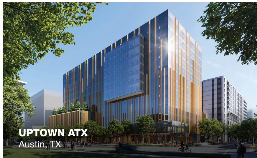
UPTOWN ATX Austin, TX