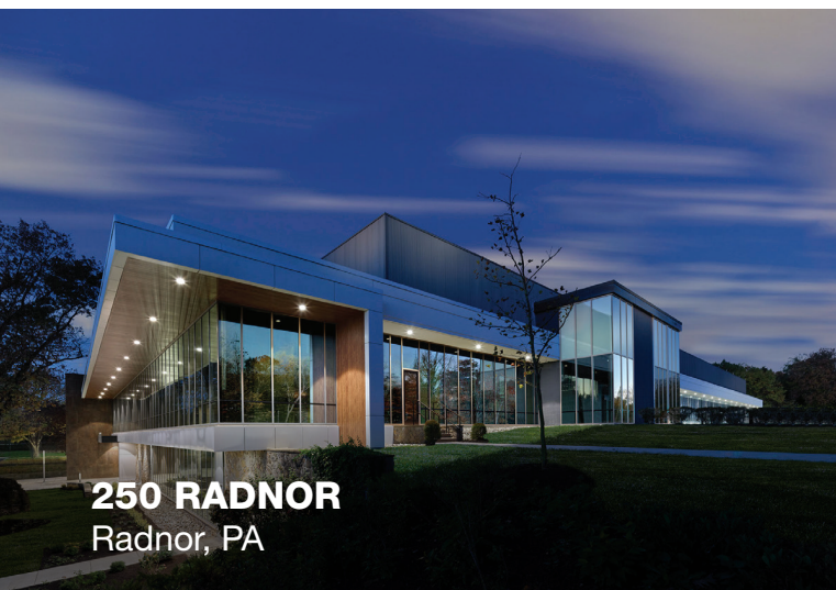
250 RADNOR Radnor, PA