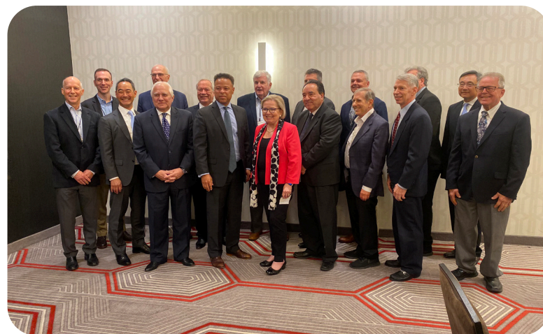
Asia and China Club Members at a luncheon with ASEAN Business Council