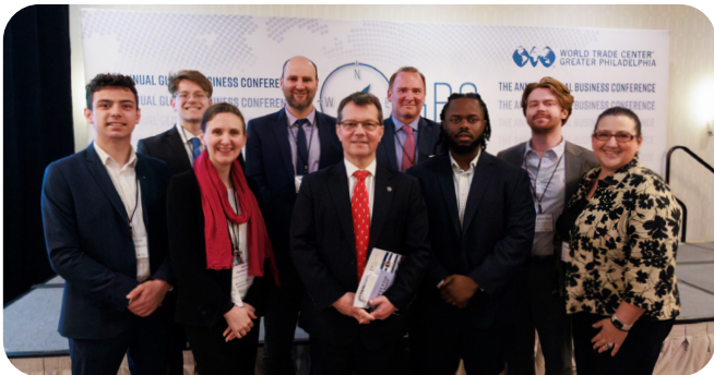
Temple University students and staff attending the 19th Annual Global Business Conference.

We also assist university partners with international student recruitment. Such programs are customized for each specific institution and student population.