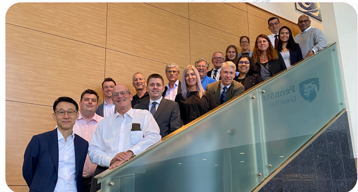
PA Authorized Trade Representatives and World Trade Center staff at Bringing the World to Pennsylvania at Penn State Great Valley.