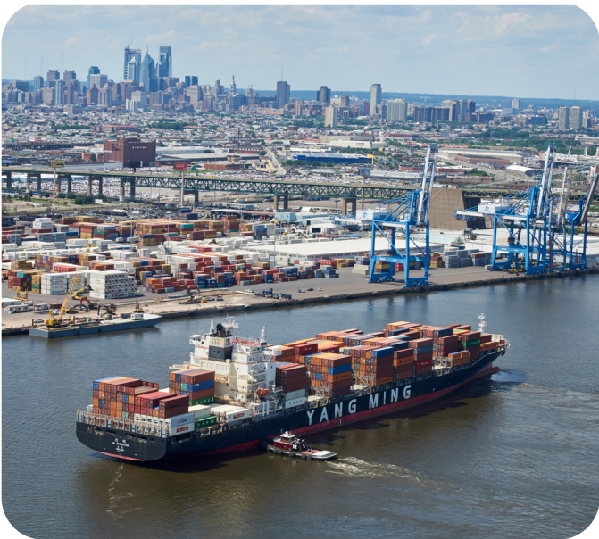
View of the Port of Philadelphia