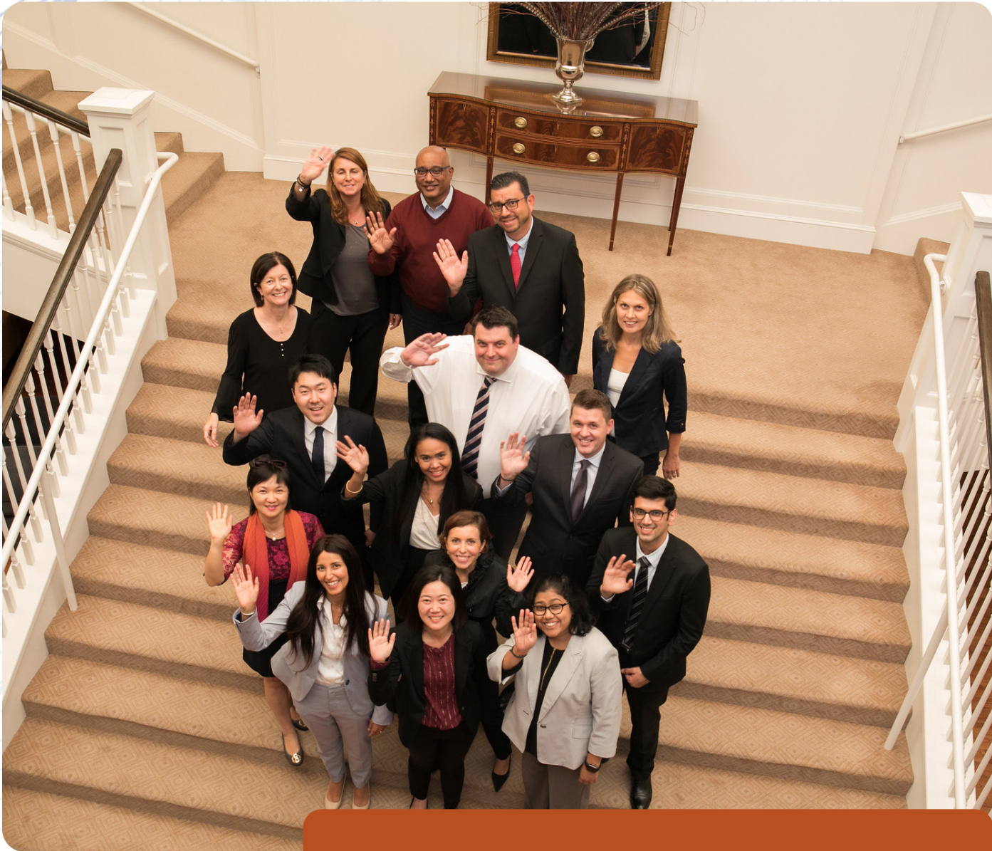
PENNSYLVANIA AUTHORIZED TRADE REPRESENTATIVES FROM “BRINGING THE WORLD TO PENNSYLVANIA.”

Companies rely on our International Trade Specialists for their expertise and connection to services that help them grow their global business. The Commonwealth of Pennsylvania has one of the most comprehensive international trade development programs in the U.S., resulting in more jobs for Pennsylvanians.