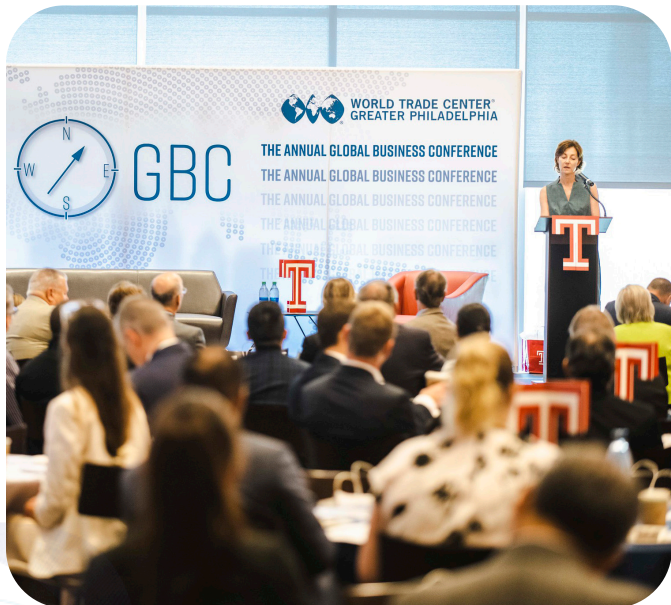
An Annual Global Business Conference held at Temple University